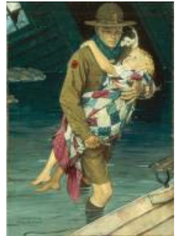
A Scout is Helpful , Norman Rockwell. 1941. Oil on canvas, 34" x 24" Illustration for Boy Scouts of America Calendar From the permanent collection of Norman Rockwell Museum Licensed by Norman Rockwell Licensing Company, Niles, IL;

Are you unable to bring your group to the Museum? Please ask if the program you are interested in can be offered as an Outreach Program.