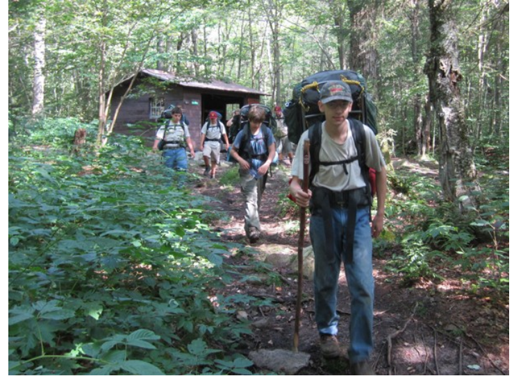
Troop 54 Scouts leave a trail shelter on the Appalachian Trail near Bennington, VT August 2010