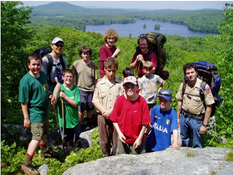
Troop 54 Scouts pose on top of Mount Hunger on the Midstate Trail near Ashburnham, MA June 2008