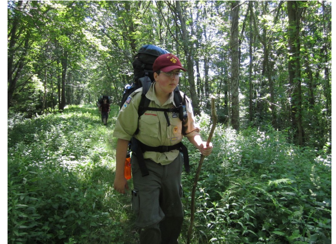
Troop 54 Scouts on the Airline Trail near Pomfret Center, CT June 2012