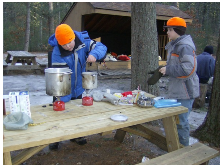
Troop 54 Scouts cook dinner in Arcadia Management Area in Hope Valley, RI February 2009

Weight is important - every ounce counts!